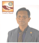
BOY OTANES RY 2003-04