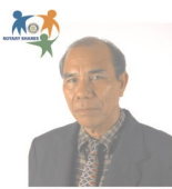
CARLING GANADOS RY 2007-08