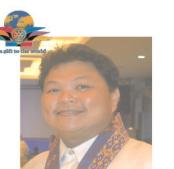
JUGGER LLIDO RY 2015-16