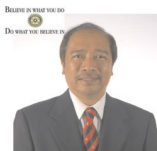
CP/PAG ZENN ZUZON RY 1992-94