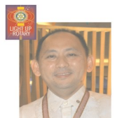
PAG ERICO UY RY 2014-15